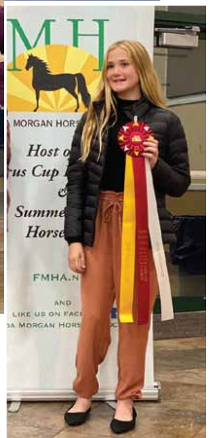
SOME HAPPY HIGH POINT WINNERS